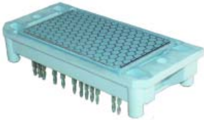
Figure 4: A module with Press-fit pins and phase change material

This is why the developed stencils and silk screens to apply thermal components to its modules. Customers may use these stencils to apply their own thermal interface material or order modules with pre-applied phase change material.