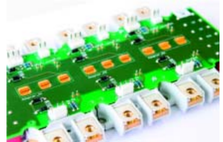
Figure 7: Three flowSCREW 2s modules connected via a common PCB

ing technologies. The flowSCREW 2s is the first module on the market suitable for IGBTs with high switching speeds. Designed to reduce switching losses and make paralleling much easier, these modules afford designers unprecedented opportunities to minimize applications.