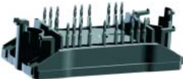
Figure 1: flow0 module with three MOSFET and IGBT in parallel

This article explains the different types of assemblies and topologies using a module with a 3-level topology as an example. The figure below shows a flow 0 module with this NPC topology.