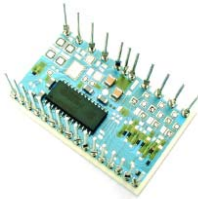
Figure 6: The flowIPM 1B module

Vincotech also assembles passive components such as shunts, resistors, and capacitors to improve efficiency and flexibility. A small capacitor placed between DC+ and DC- can be very beneficial in some applications with high switching frequencies because it helps minimize the current loop. This is why modules such as the H-Bridge are available with and without a built-in ceramic capacitor as a standard feature. The flowIPM 1B attests to Vincotech's manifold abilities in assembling passive components.