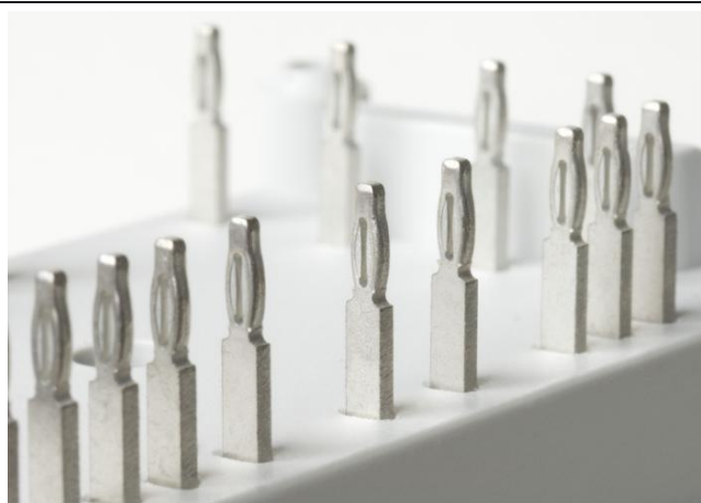
Figure 3: Press-fit pins for solder-less mounting

Vincotech's 600V flowPIM + PFC comes in a compact flow 1 housing equipped with Press-fit pins (see Figure 3 ). Press-fit technology reduces PCB assembly time and effort considerably by eliminating the need for soldering. This cuts process time and costs and boosts production output.